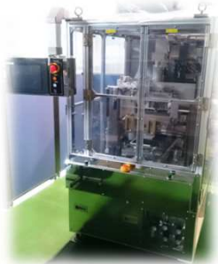
Rubbing Machine (Small - Middle size)