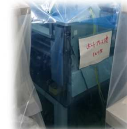
Hot press (Assembly, Heat cure)