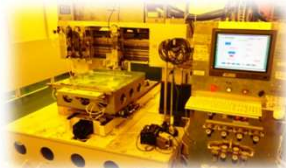
Sealant, transfer application