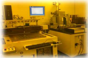
Cutting Machine, Polarizer Laminating Machine