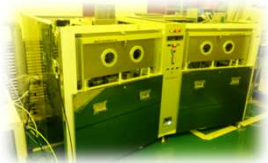
Vacuum bonding machine