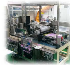
PI Printer (Small - Middle)